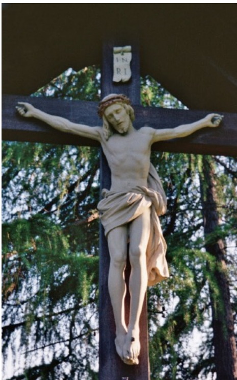
"Christ has died"