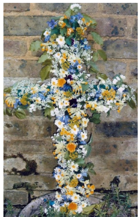
"Christ will come again"