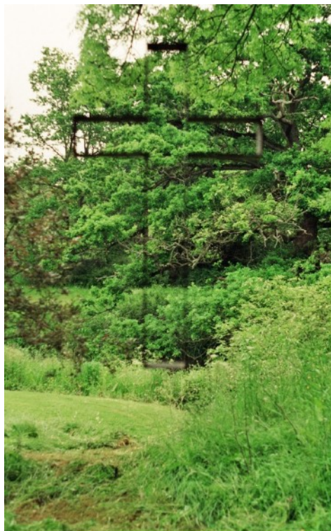
"Christ is risen"